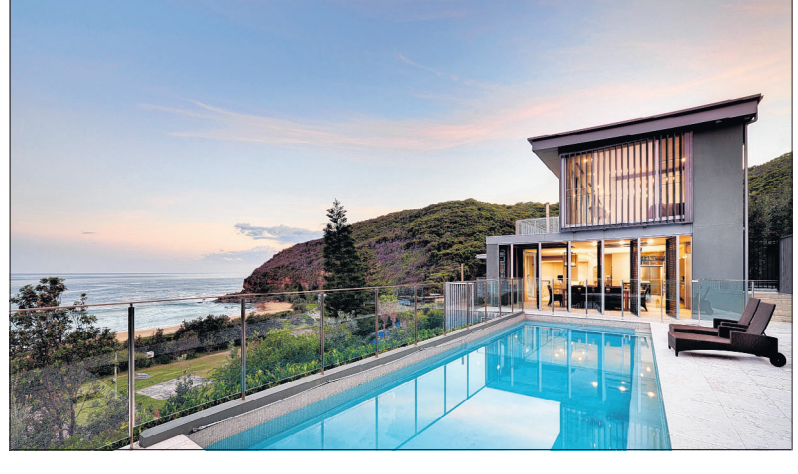
COOL OFF: The pool at Killcare Beach House. Above, deserted golden sand beach at Killcare.

The area is rich in wildlife and Aboriginal history. Around 100 Aboriginal sites have been discovered on the peninsula, including middens, rock engravings and rock shelters of the Guringai people.