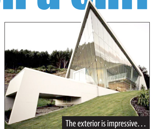
The exterior is impressive. . .