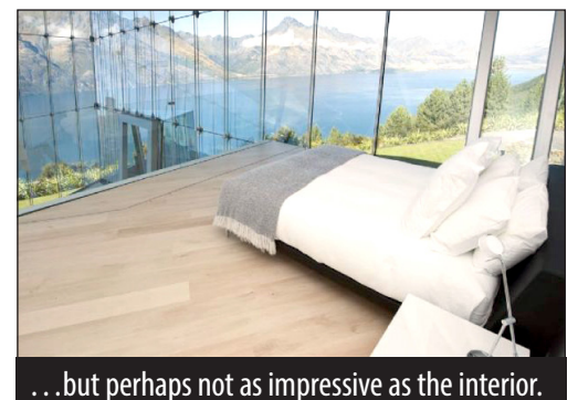
. . .but perhaps not as impressive as the interior.

mechanical engineer, said 8,000 cubic metres of rock were excavated to form the platform for the house. A wine cave and two-car garage are chiselled even further into the bedrock.