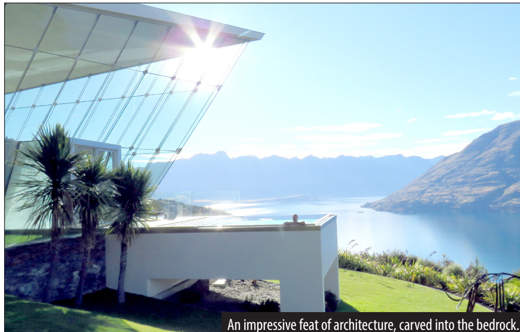
An impressive feat of architecture, carved into the bedrock.

One of the owners and designers of Jagged Edge, a Wellington-based