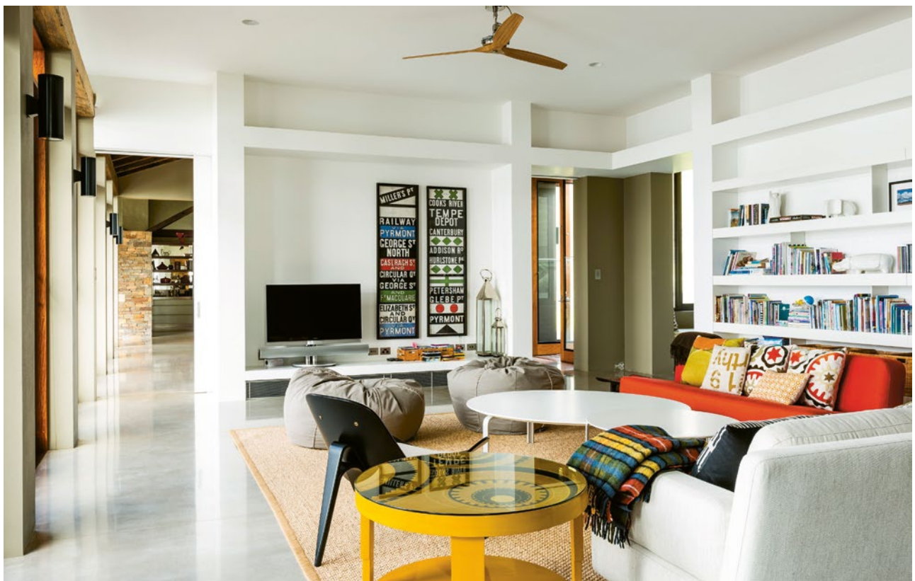
Designer Nic Graham combined vintage and contemporary pieces for an eclectic mix