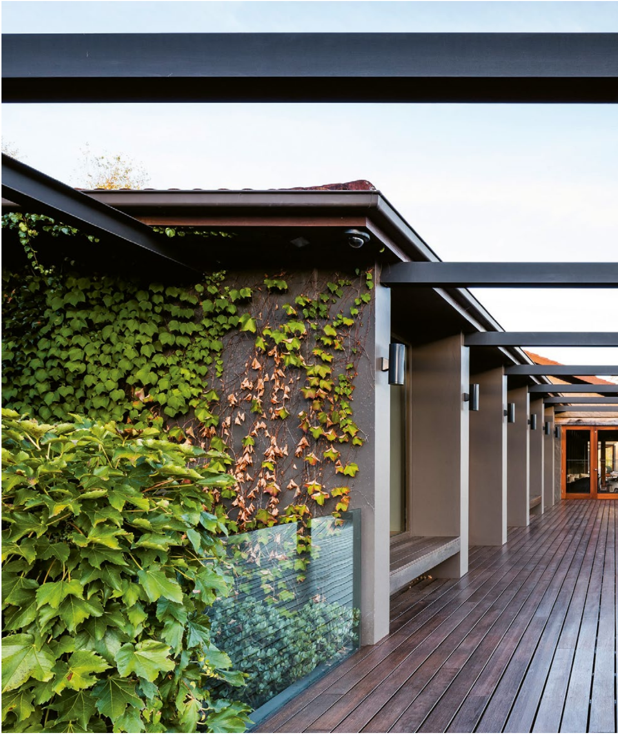
Overlooking Kangaroo Valley, the large deck is ideal for relaxing with a book or for al fresco meals with the family