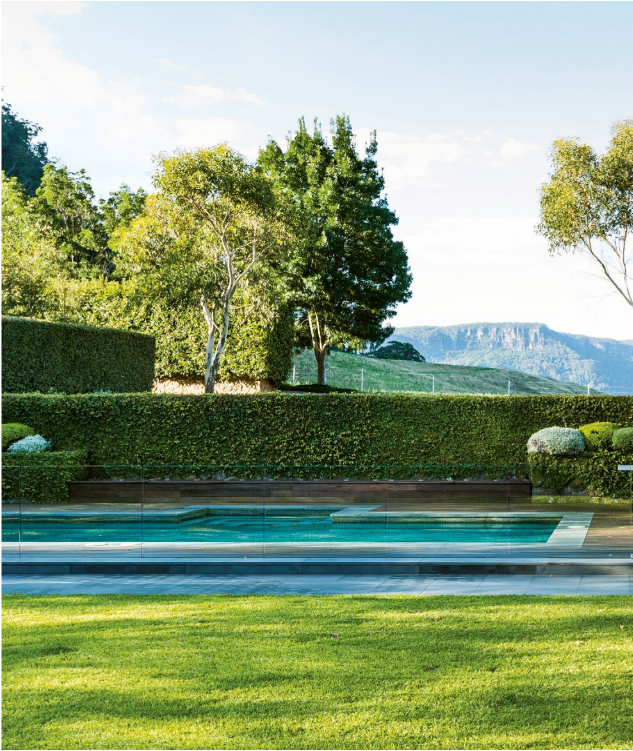
The living space extends to the outdoors with terraces, lush landscaping and recreational areas