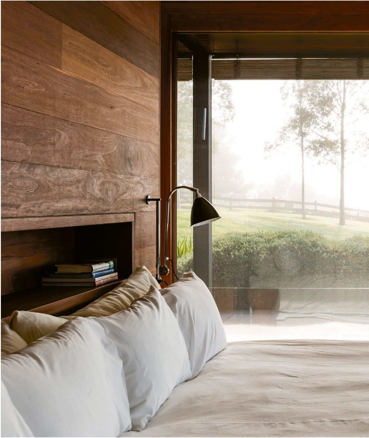
Interior spaces were designed to feel deeply embedded within the natural surroundings