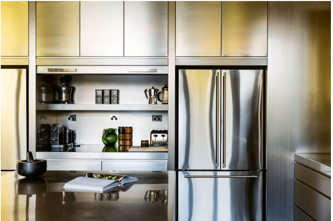
Stainless steel appliances give the kitchen a sleek, polished look that fits the contemporary vibe of the house