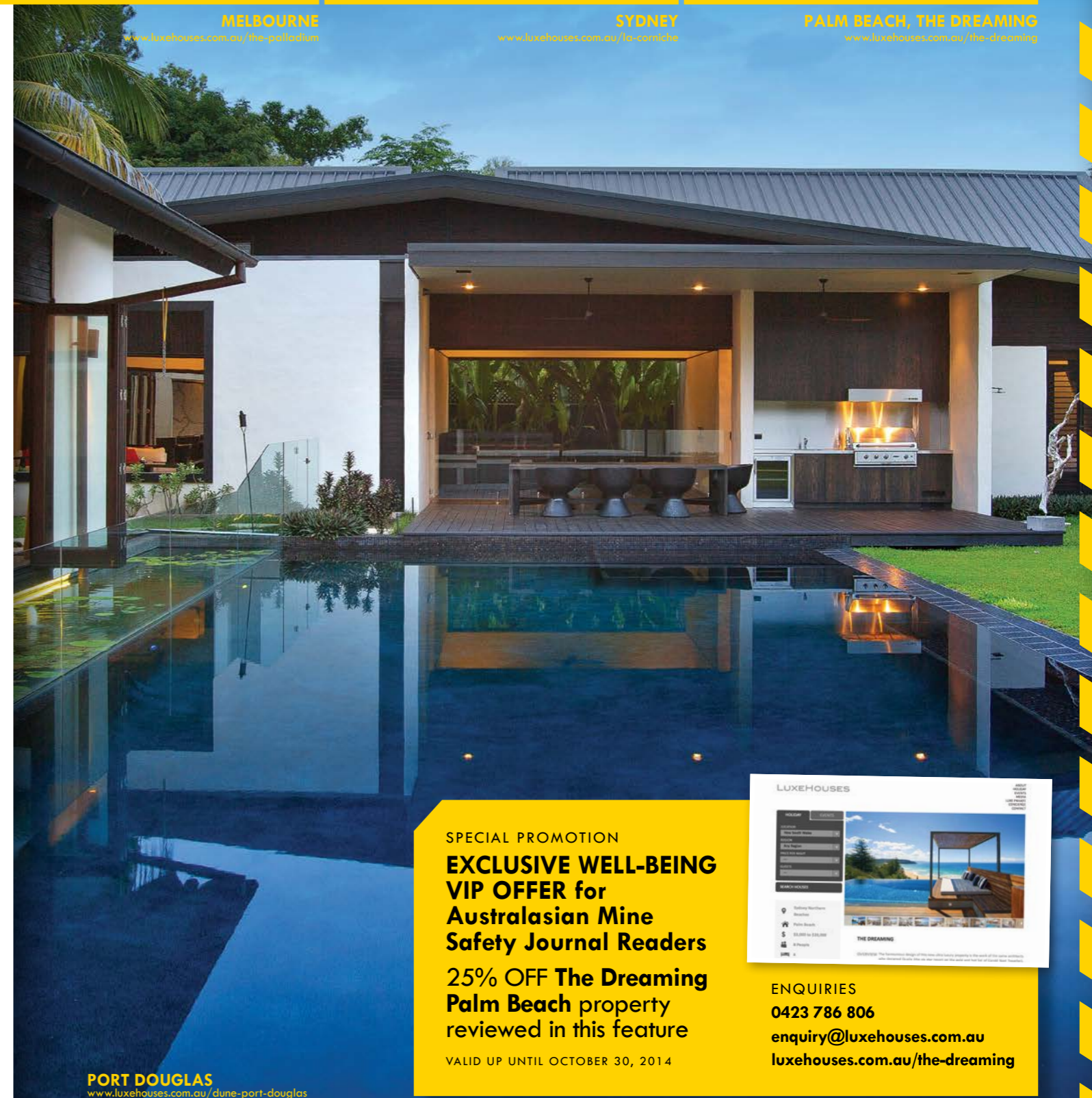
PORT DOUGLAS www.luxehouses.com.au/dune-port-douglas

SPECIAL PROMOTION EXCLUSIVE WELL-BEING VIP OFFER for Australasian Mine Safety Journal Readers 25% OFF The Dreaming Palm Beach property reviewed in this feature