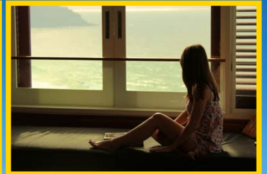
PALM BEACH, THE DREAMING www.luxehouses.com.au/the-dreaming